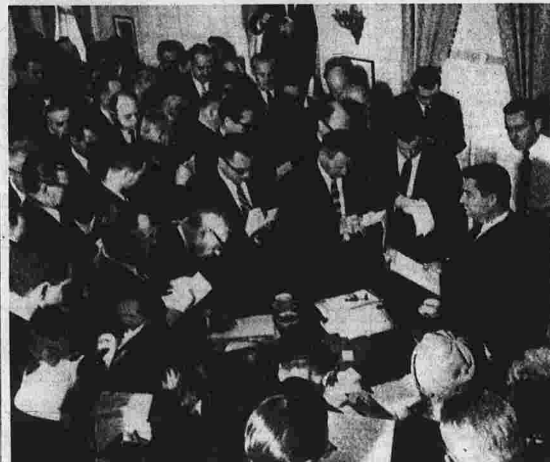
White House Press Secretary Pierre Salinger tells reporters at the White House that President Kennedy has asked for time on television to address the nation tonight on "a subject of the highest national urgency."